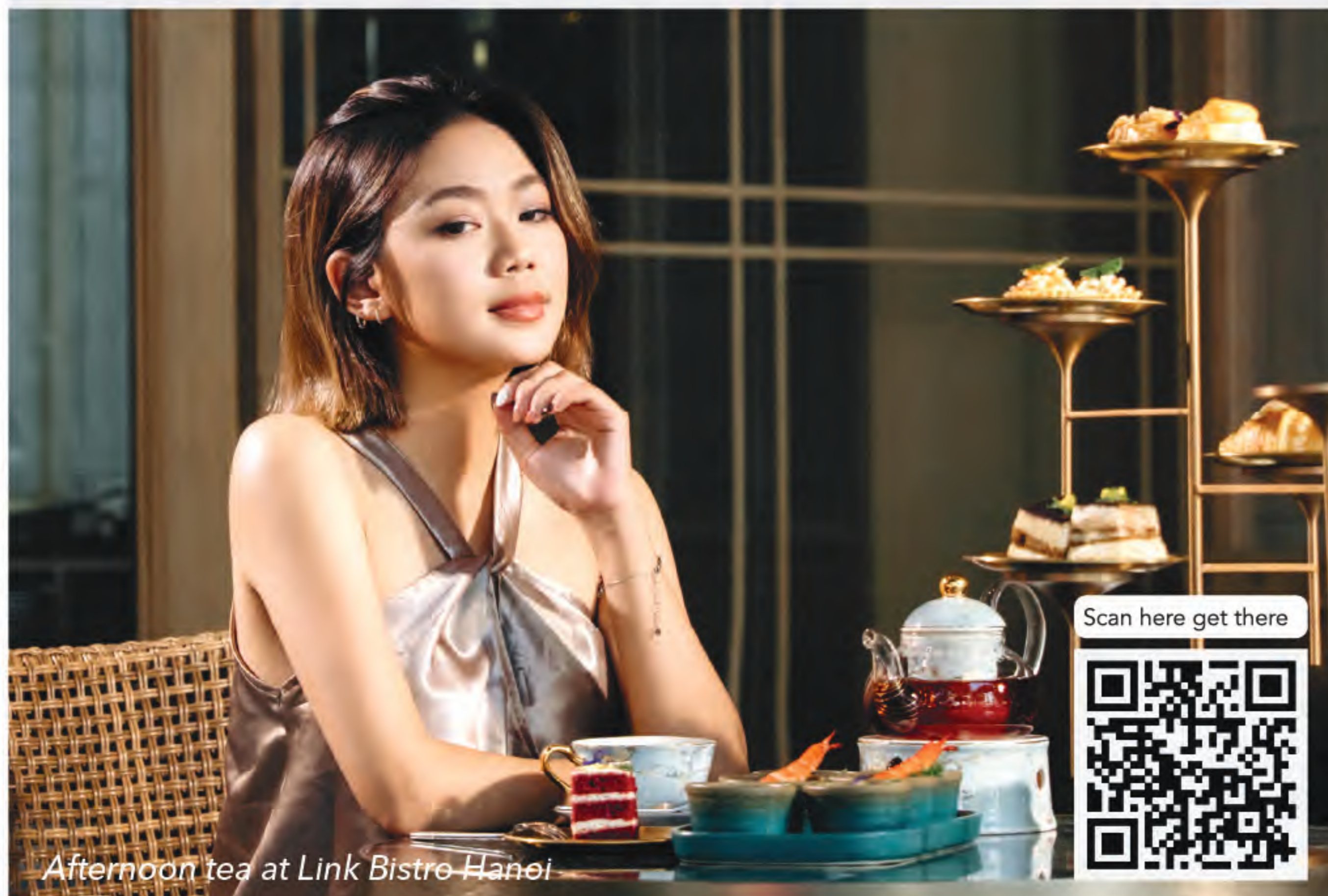
Afternoon tea at Link Bistrot Hanoi

Groups of four guests receive 15% off with advance reservations.