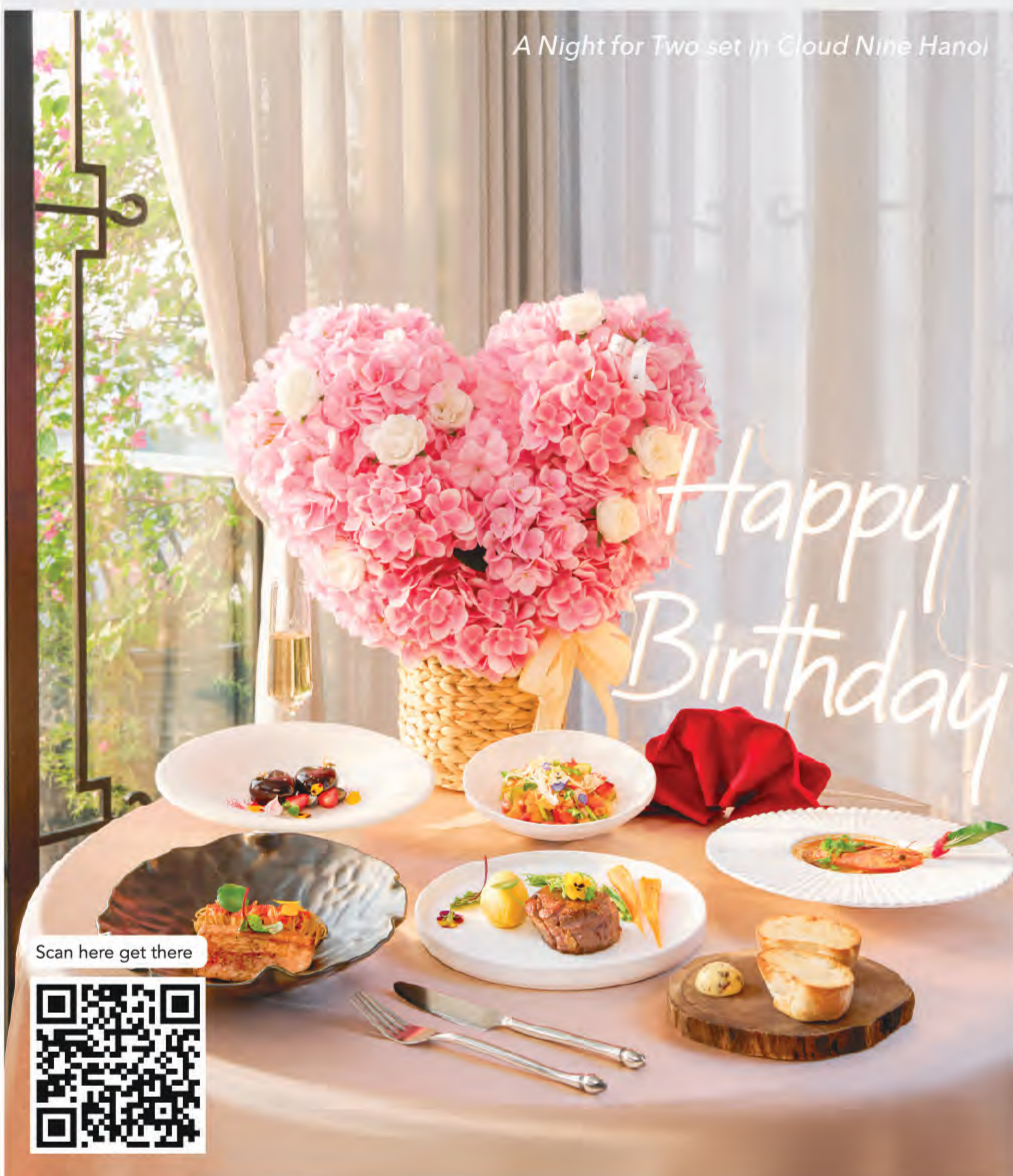
A Night for Two set in Cloud Nine Hanoi

Live Violin Night Enjoy signature cocktails accompanied by a magical solo violin performance. Every Saturday | 20:30 - 22:30