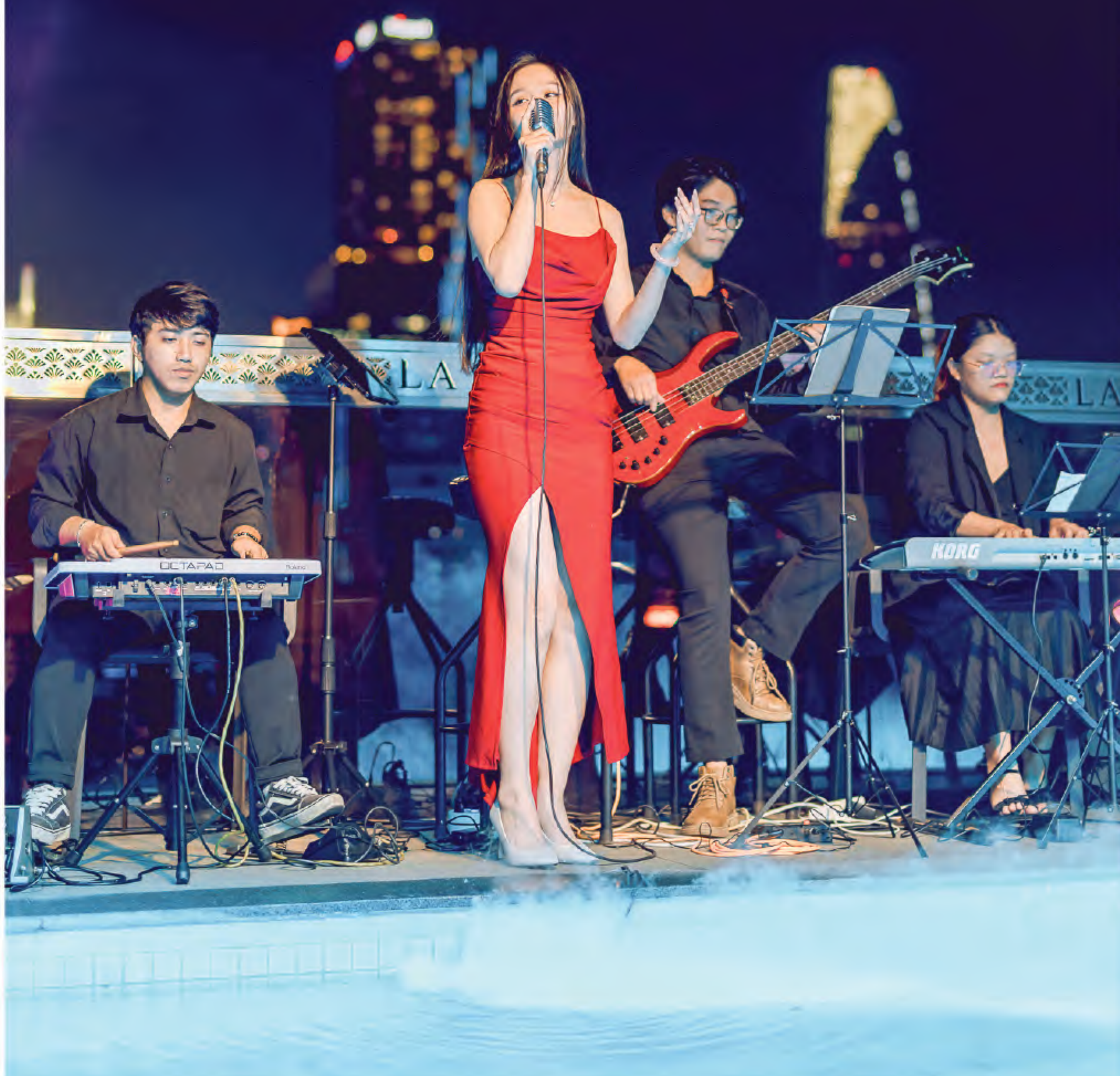
Romantic dinner at Cloud Nine Saigon