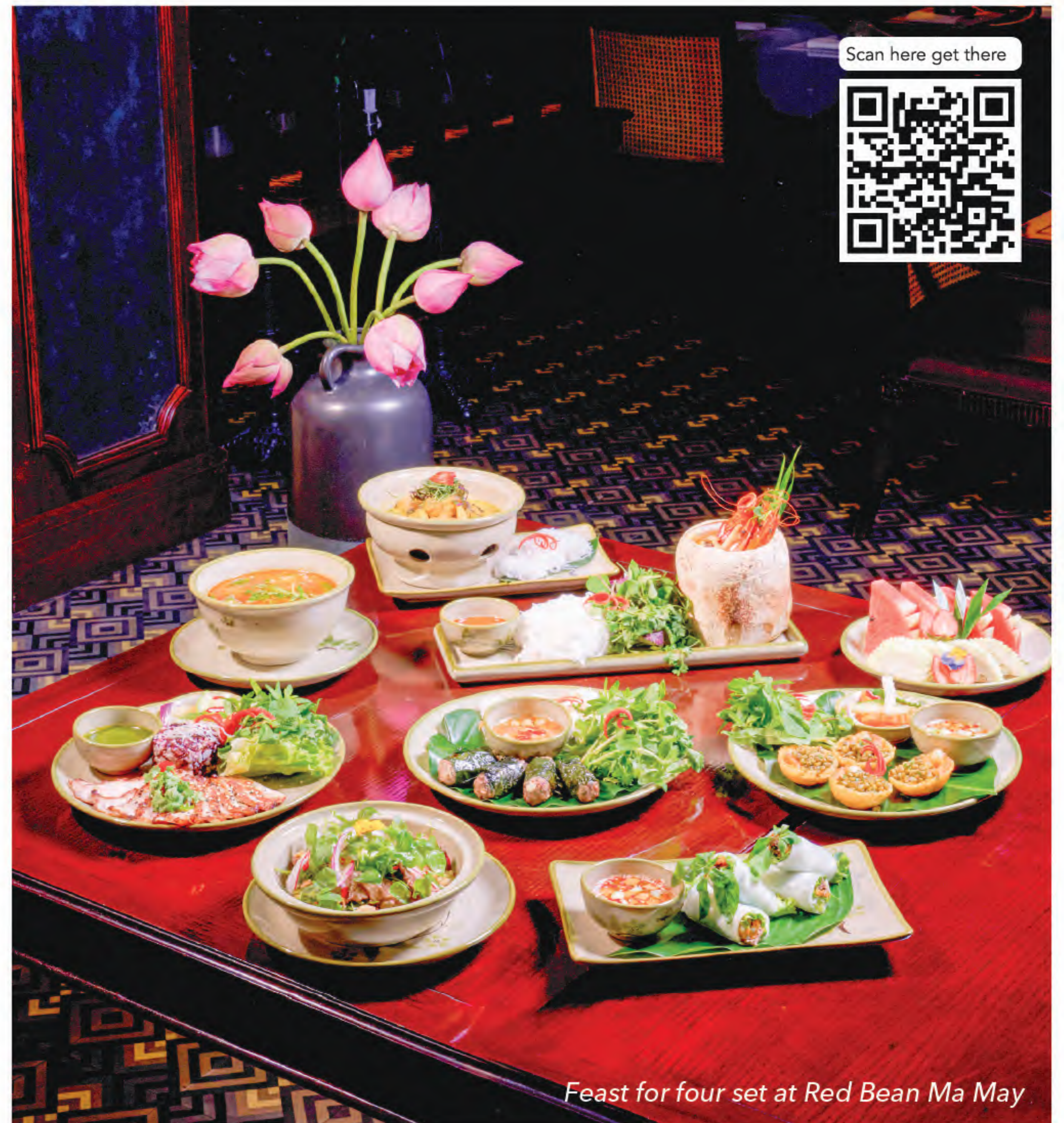
Feast for four set at Red Bean Ma May