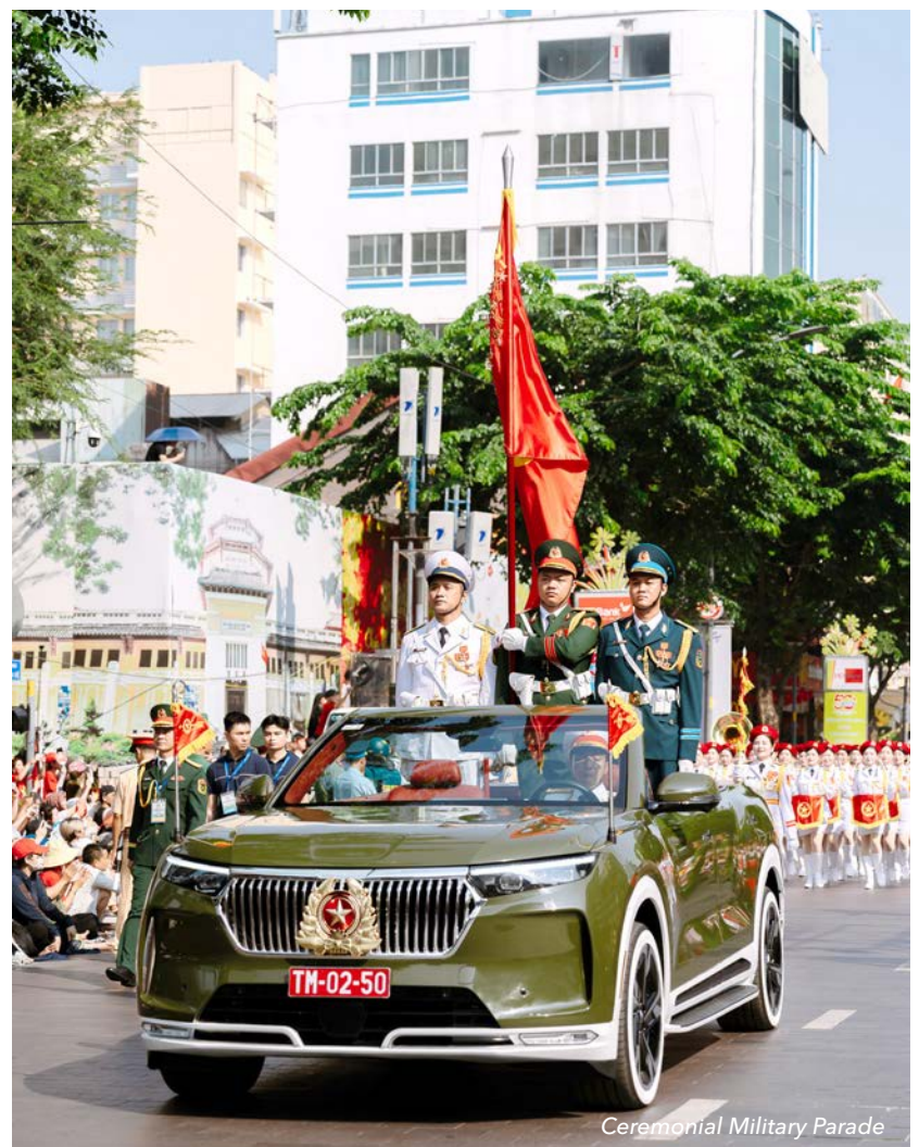
Ceremonial Military Parade

Welcome to Vietnam , where history lives on in the hearts of its people, and where love for the homeland shines brighter with each passing day.