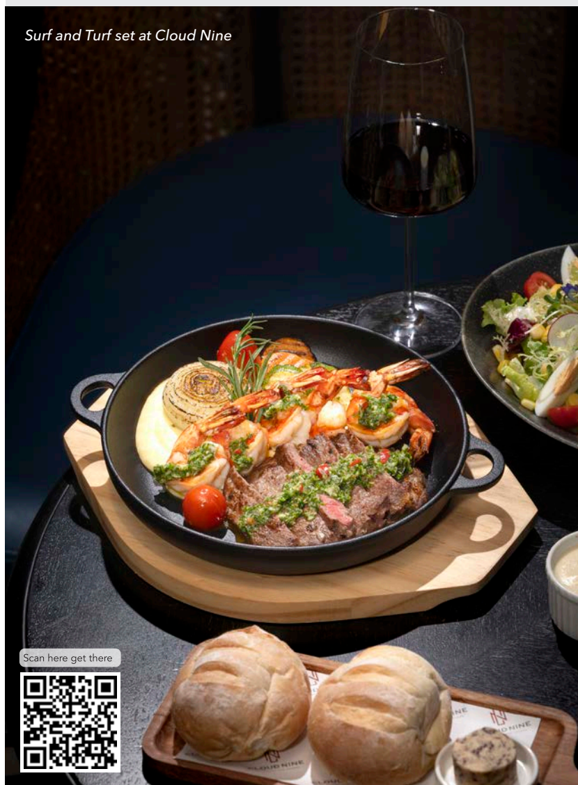
Surf and Turf set at Cloud Nine

Summer Fling Menu | 01.05.25 - 31.08.25 Featuring refreshing mocktails at only VND 99,000