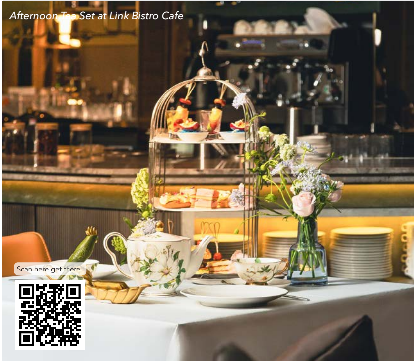
Afternoon Tea Set at Link Bistro Cafe

Happy Week: Appealing promotions and fun activities await you at Aqua Sky Bar