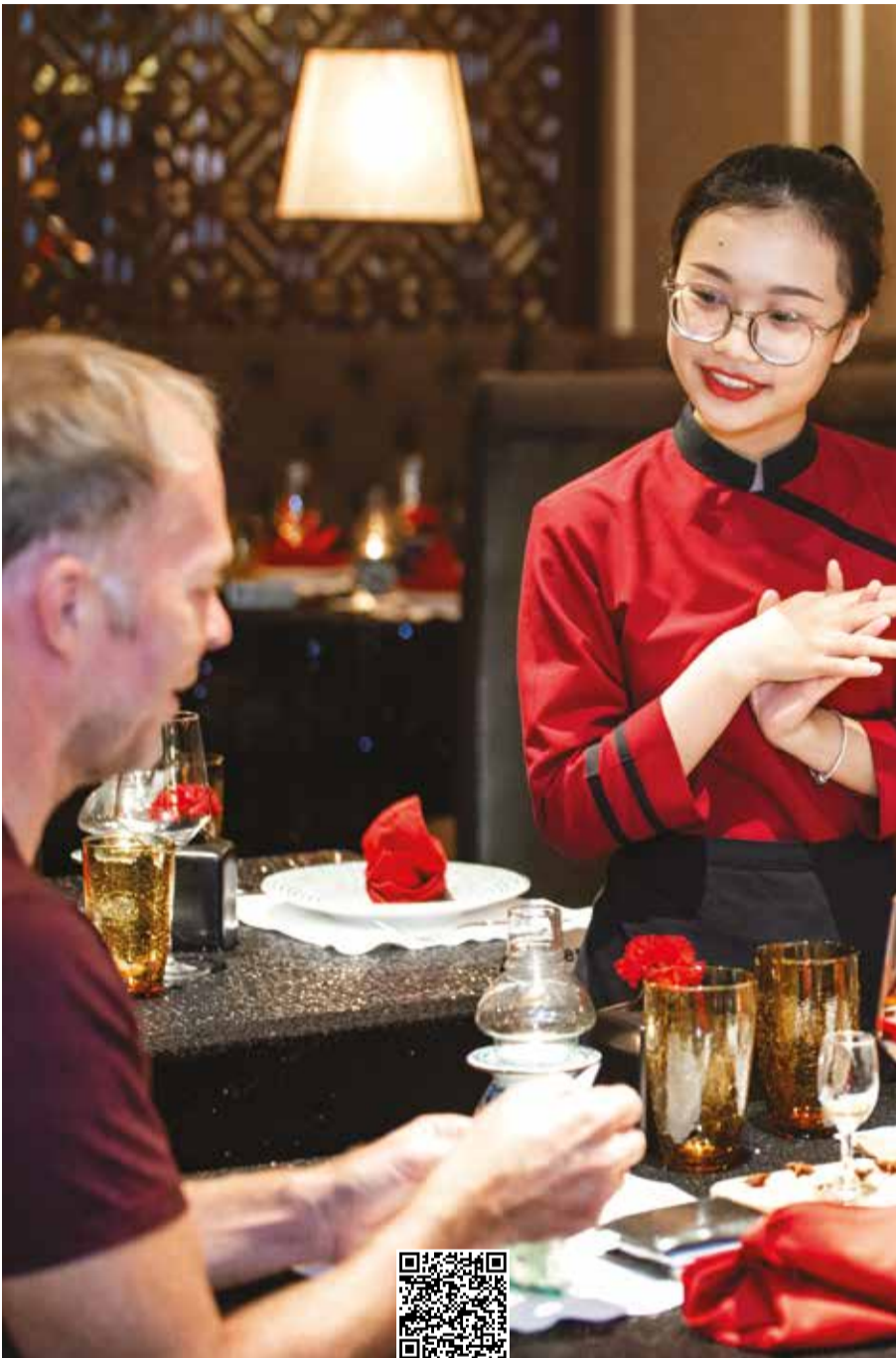
Scan here, get there!