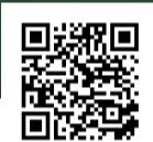
Scan here, get there!