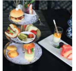
Tea for two

Sit back, relax and enjoy our afternoon tea menu